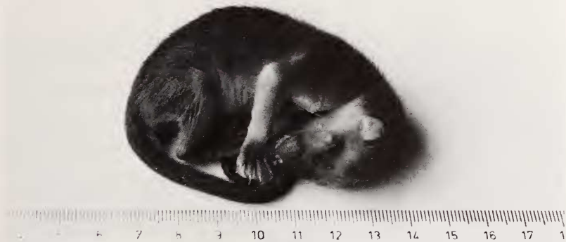
Fig. 4. 3-day-old ♂; weight: 40.5 g